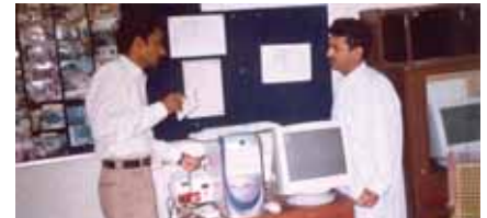
SPEIP team members inspecting the computers

The Sindh Education Foundation (SEF) has successfully completed the distribution of computers to 117 private schools in five districts of Sindh. Pentium 4 computers with essential peripherals have been distributed to private schools, which are partners of SEF under the Support to Private Educational Institutes Program (SPEIP). SPEIP is an innovative program of SEF under the Government's Public Sector Development Program (PSDP) which strives for institutional development and quality advancement support to low cost private schools in areas of teachers' development, school management and Information & Communication Technology (ICT) by developing a School Improvement Program for each school.