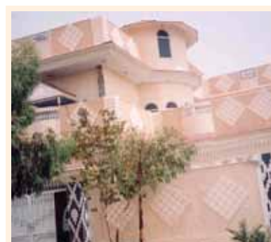
The re-established SEF office at Larkana

To further strengthen operations under its Education Support Network (ESN) Program the Sindh Education Foundation (SEF) has re-established its regional office in district Larkana. Nearby districts are served and supported through this office. SEF's ESN program is geared towards creating strong linkages amongst all stakeholders at the district and local level especially with the functionaries of the local government. These linkages are being developed with the purpose of training and capacity building, resource mobilization and, most importantly, reviving closed schools through community ownership and participation.