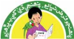
Meena and her parrot - mascots of the AGE Project

In Pakistan, particularly in Sindh, girls continue to face discrimination with regard to access to education. Out of 40,121 government primary schools in Sindh only 6,348 cater to girls' education - an appalling and meager 15%. 'Acceleration of Girls' Education' (AGE) is an initiative of the Department of Education & Literacy, Govt. of Sindh and UNICEF, in collaboration with the Sindh Education