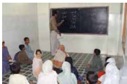
A classroom session at the new CDC premises

The Sindh Education Foundation's Child Development Center (CDC) is located in Sher Shah, Colony UC-7 of Kemari Town. The colony is located in the proximity of the SITE industrial area. The abundance of factories and businesses functioning in the locality is the foremost reason why many working children live there. Since January 15, 2000, the CDC has been running in a five room premises in which educational and recreational facilities are provided to more than 200 working and street children.