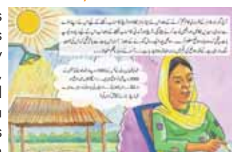
A glimpse from "Khushhali ka Safar"