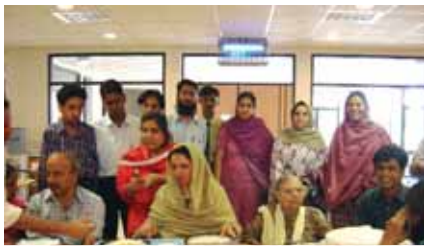
Ms. Zubaida Jalal, former Federal Minister for Education and the SEF team

The Sindh Education Foundation's (SEF) strategic focus is shifting from being just an initiator of educational programs or a conventional education and development organization to being a dynamic and proactive agency, engaging in possibilities of addressing conceptual/intellectual, capacity and innovation gaps in the education sector. The need for such a transformation resulted from the changing role of the organization. To keep alive the creativity, innovation and intellectual thought in the field of education SEF organized a two week 'Professional Retreat' for its staff.