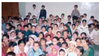
Children at the CDC celebrating Universal Literacy Day

Universal Literacy Day was celebrated on September 8, 2004 at the Child Development Center (CDC), Sher Shah. 27 mothers and children were invited to attend the ceremony. Such an audience was most appropriate to discuss the importance of education for boys and girls and the role of the mother in her child's education and development.