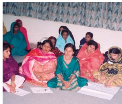
Teachers participating in group activities at the HSP training.

The education system in most developing countries is increasingly being seen as providing tools to engage communities towards social reform. In this regard teachers are deemed to be the main proponents for promoting critical thinking. It is important for teachers/educators/developers to understand the importance of teachers' beliefs about education & their relationship with teachers' practices.