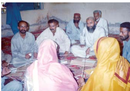
Teachers participating in 'forming the learning web' activity.

The Fellowship School Program (FSP) is based on a community school model that aims at providing quality education in numerous districts of Sindh. The Parents Education Committees (PEC) established in these schools are representative bodies of parents and communities which manage and monitor the schools. In order to further strengthen the PECs a cluster based training was arranged by FSP between May 2 and May 25, 2005 for 350 participants.