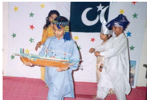
Children celebrating Pakistan Day at the CDC.

Since its establishment CLEP's Child Development Center (CDC) has been celebrating Pakistan Day every year with much fervor. This year too different activities were scheduled for March 23, 2005. The rehearsals had begun long before the event. A number of students from various grades delivered speeches on topics related to the day and gave performances on national songs. Tableaus depicting issues pertaining to working children in society were also performed. A quiz competition, relating to general knowledge and topics from their syllabus was also arranged for these students. The program continued for three hours and was concluded with a vote of thanks by the Center Coordinator & CLEP Program Manager and a photo session with all the children and audience.