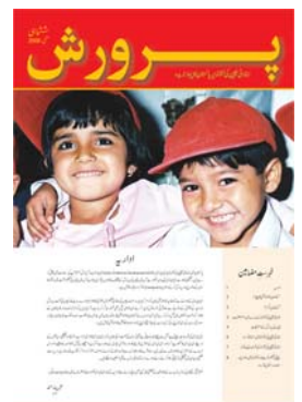
Parwarish: Volume 1

One of the newest additions to SEF's array of publications has been the Urdu version of Nurture – Pakistan's pioneer publication on Early Childhood Development (ECD). This publication, named Parwarish , has been launched with the intention to reach out to a wider audience. It is also inline with SEF's belief that for advocacy campaigns to be effective they ought to be more contextualized and should primarily be carried out in the local language. Parwarish is a thematic magazine, with the themes revolving around various issues such as positive parenting, care giving, health, hygiene, etc. For the first volume of Parwarish several portions of Nurture (English) were translated to Urdu. These will be distributed in several districts of Sindh and Balochistan. It is targeted towards parents and teachers of children between the ages of 0-8 years and attempts at drawing attention towards early childhood developmental issues and practices at the communities' level.