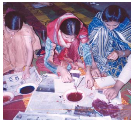
Participants busy with an arts and crafts training.

During the past quarter, the Fellowship Schools Program (FSP), a community school model of the Sindh Education Foundation (SEF), conducted refresher courses for 92 teachers. These trainings were held cluster-wise in Hala and Khairpur during the first week of April, 2005. The objective of these one-day trainings was to improve the quality of education imparted at the Fellowship Schools. During the training the teachers were provided trainings on teaching multigrade classrooms, teaching arts and crafts and conducting functions and assemblies.