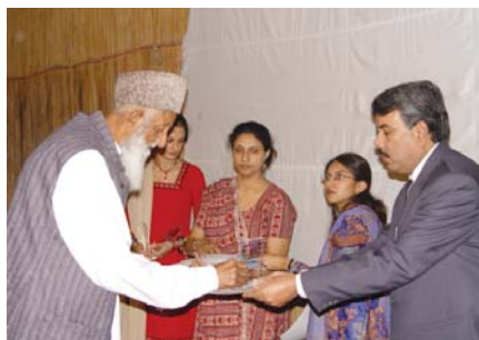
Heads of the schools at the MoU signing ceremony.

During the past quarter, 133 additional private schools were selected to be part of the SPEIP family – taking the total to 300 schools. Among the new partners 68 schools are from Hyderabad, 13 are from Thatta, Dadu and Badin, and 26 are from Khairpur. To initiate the intervention, Memorandum of Understanding (MoU) signing ceremonies with new partner schools were held on April 7, 2005 in Hyderabad and Thatta and on April 9, 2005 in Khairpur, Dadu and Badin.