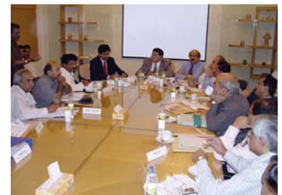
Education Secretary heading the Annual Planning Meeting.