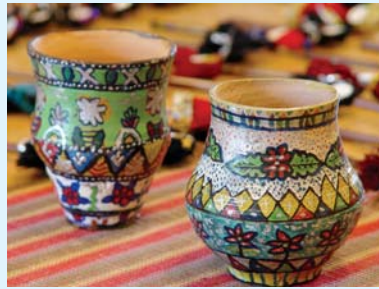
Artwork created by the children at the FUNPARA project.

The Community Supported Schools Program (CSSP) initiated a FUNPARA Project in September 2004. The FUNPARA project provides opportunities for children to learn and develop their art skills. These children have developed extremely innovative things such as fancy pencils, bracelets made of beads and other wonderful works of art. This project provided an opportunity to the students of the Community Supported Schools to further enrich their skills by learning to develop material with clay and glass. The items developed during the project were a huge hit at two mela's held during the quarter (see below) and are currently on sale at the SEF head office. Interested individuals are requested to contact the Marketing Advocacy & Publications Unit, Sindh Education Foundation.