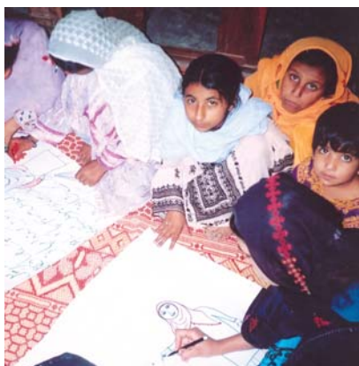
Learners of the Literacy Centers busy in group work.

In its course of work since 2001, the Women's Literacy and Empowerment Program (WLEP) has noticed that enrollment rates have been declining continuously as a result of poor health conditions prevalent in the communities. Hence, integrating health in its activities was becoming a pressing need. In order to forward this cause two 4-day trainings from April 26 - 29, and May 7 - 10, 2005 were conducted for the Learning Facilitators and Assistant Learning Facilitators of WLEP. These trainings, which were held in Karachi and Sehwan, were attended by approximately 26 participants. The primary objective of these trainings was to increase awareness of participants regarding the importance of health and literacy integration.