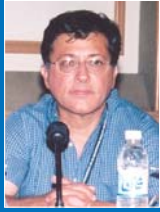
DR. PERVEZ HOODBHOY