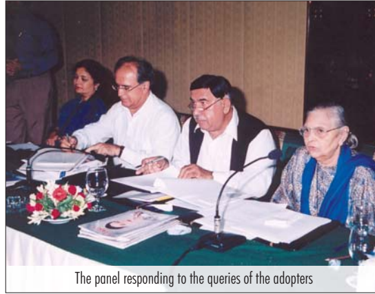
The panel responding to the queries of the adopters

During the month of June this year the Sindh Education Foundation held a two-day seminar for the Adopt-A-School Program. The seminar was conducted to share views and perceptions regarding the program and possibilities of strengthening the program. The seminar provided a platform to adopters, SEF, government school representatives and government officials to collectively discuss program-related issues and reach a consensus regarding key policy recommendations.