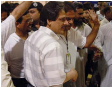
Honourable, Governor of Sindh, Mr. Ishratul Ibad reviewing SEF's stall

The DAWN Group of Newspapers recently conducted the much celebrated 'ALL ABOUT LIFESTYLES' exhibition from June 10-12, 2005. This was the sixth annual nation-wide ALL ABOUT LIFESTYLES exhibition. It had more than 200 exhibitors taking part in Karachi and also offered attractions such as a Books & Authors pavilion, an Images theatre with a Young World pavilion for children's activities featuring competitions and prizes and several other shows and stalls.