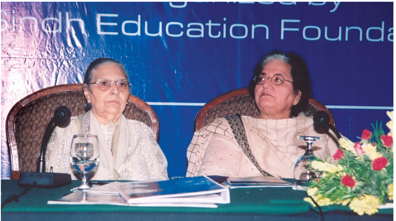
A glimpse of the QARC Conference in session