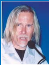
PROF. PETER MCLAREN