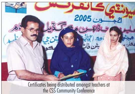
Certificates being distributed amongst teachers at the CSS Community Conference

On June 21, June 23 and June 25, 2005, SEF and the Community Development Network (local umbrella organization of Village Education Committee) arranged an event titled 'Community Conferences' in prominent cities of Sindh, including, Larkana, Meher, Sehwan and Malir, Karachi respectively.