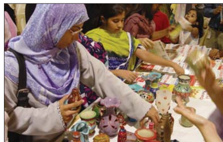
Families making purchases at SEF's stall at the DAWN lifestyle exhibition

Not only did SEF's participation in the exhibition serve to increase sales of the children's hand-made items and the number of subscriptions for the aforementioned publications but it also served to inform on a mass level of the initiatives and activities taken forth by SEF. Visitors at the stall were informed of SEF's history, SEF's programs, its services to the educational system and to more than 700 beneficiaries schools in Sindh and the opportunities SEF creates for well-meaning individuals to contribute and play their part in reviving educational support in Sindh. The stall was also visited by Governor of Sindh, Hon. Mr. Ishratul Ibad. Mr. Ibad showed his significant appreciation of SEF's efforts of promoting educational efforts at the grassroots and policy-making levels.