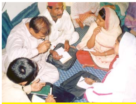
Teachers busy discussing road safety strategies for their group activity during the recently conducted training workshops in the targeted areas of the Road Safety Education Program.

100 Teachers Trained on Road Safety Practices